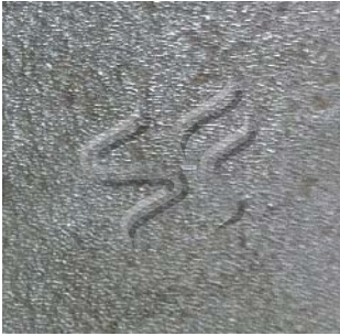
Zoomed In Texture Image